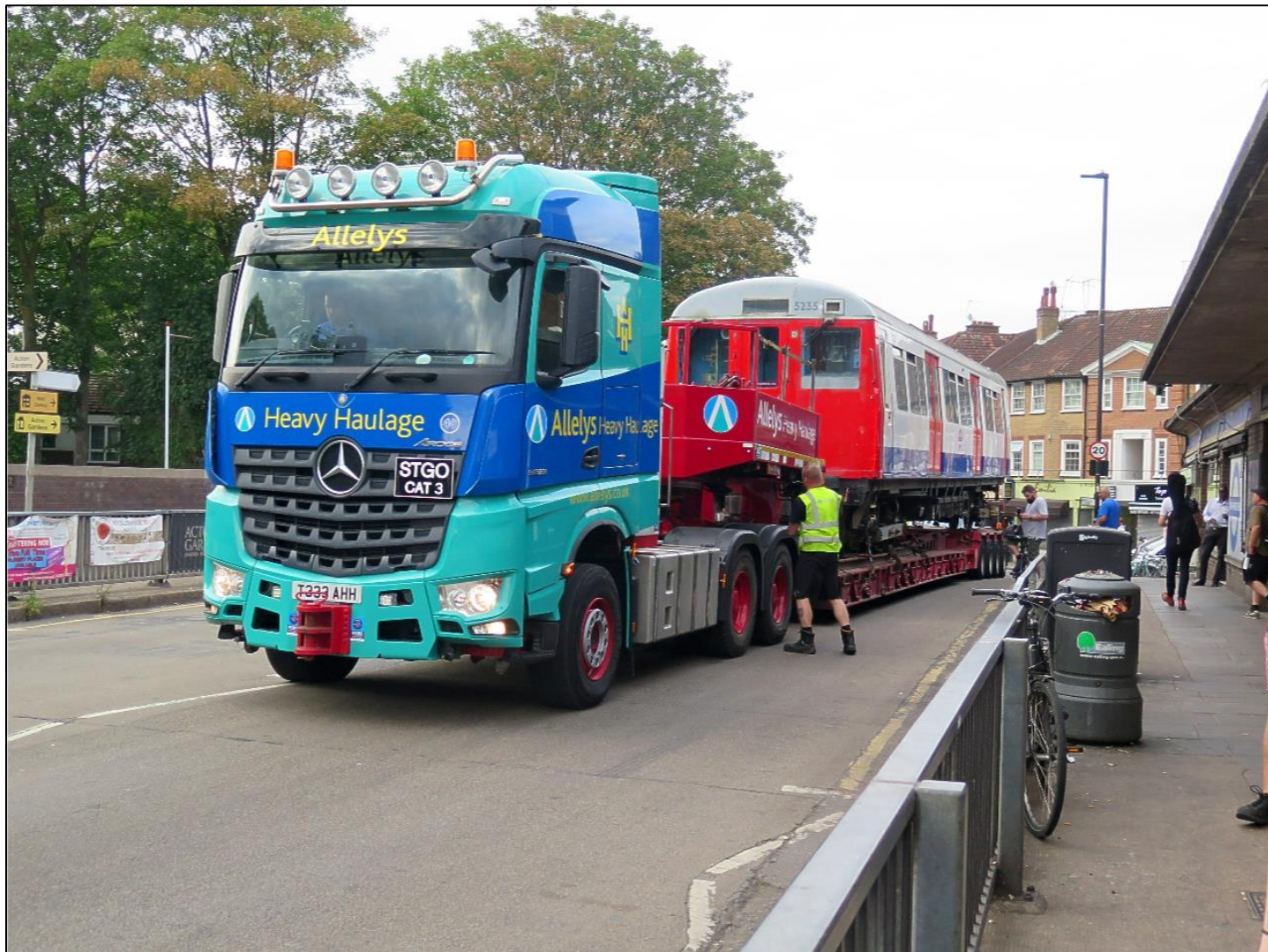
Above: On 18 July 2018, DM 5235 is seen outside Acton Town station, with adjustments being made before its trip up the motorway to Booths in Rotherham. This unit's numbers were not, of course, the originals – see page 388 of the July 2018 issue for details.