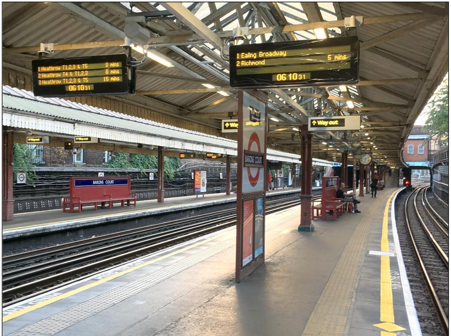
Photos: Colin Smith (Top Left and Above) on 27 July 2018 Brian Hardy (Top Right on 3 September 2009 and before refurbishment).